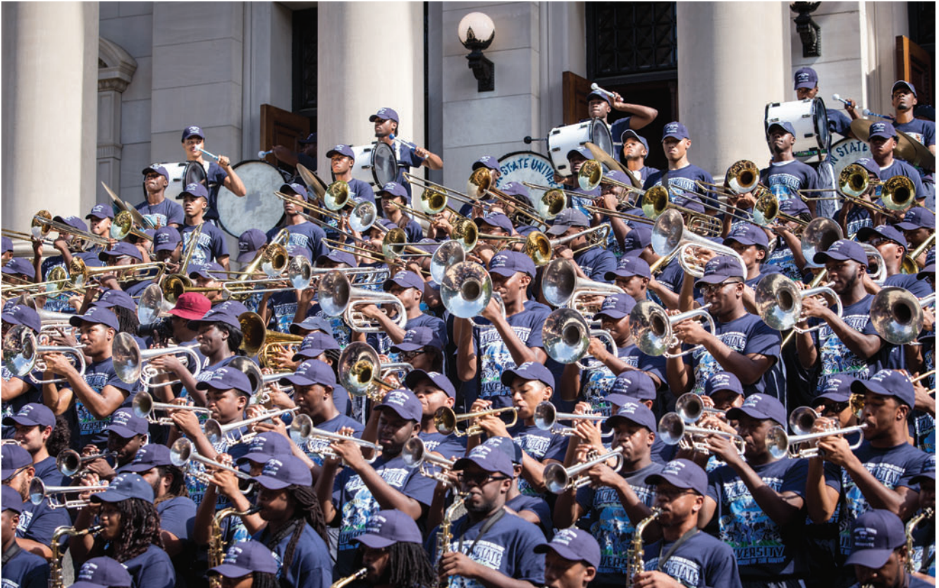
Jackson State University's Sonic Boom of the South performs during the 2015 festival.