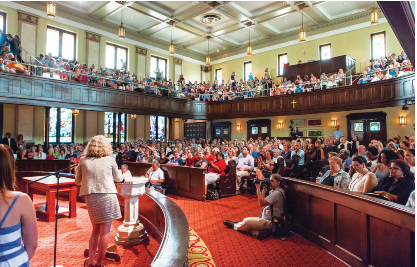
Galloway Church will once again be the main venue for several panels with famous authors.