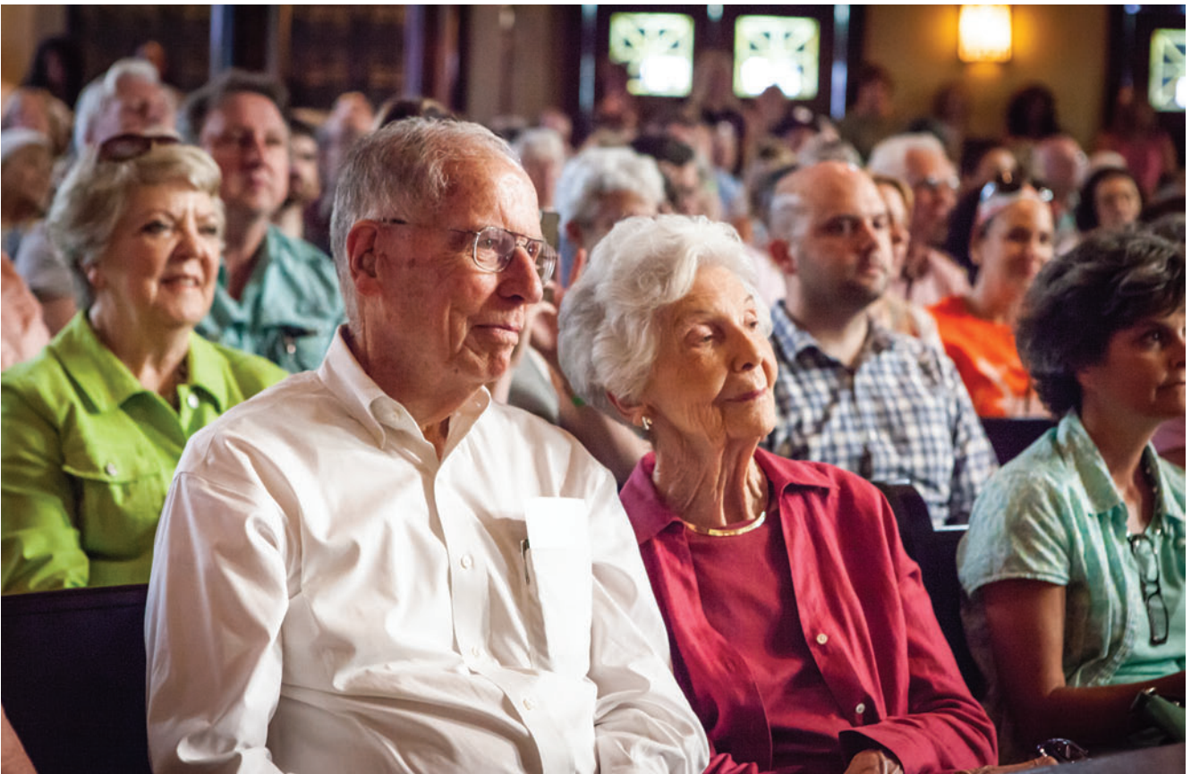
Governor Winter and his wife, Elise attending the festival.