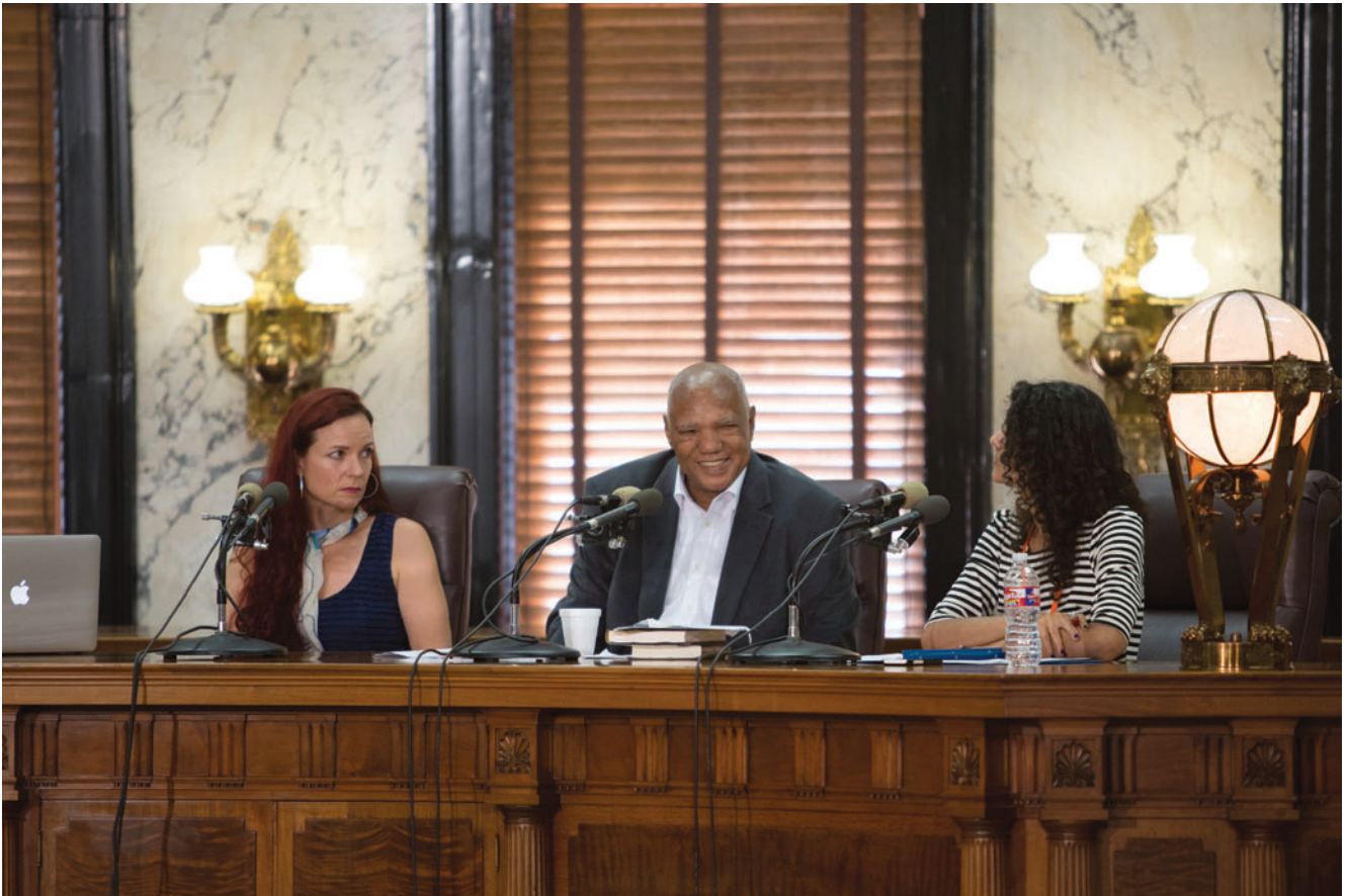
Several panels ranging from poetry to mystery scheduled throughout the festival allow readers a more personal look at their favorite authors.