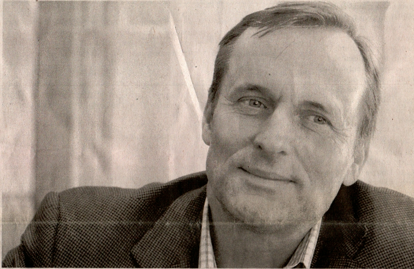
MISSISSIPPI WRITER JOHN GRISHAM, WHOSE BOOKS HAVE BEEN TRANSLATED IN 45 LANGUAGES, WILL BE A PARTICIPANT AT THE BOOK FESTIVAL.