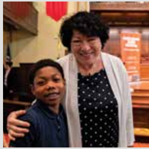
U.S. Supreme Court Justice SONIA SOTOMAYOR

cast a spell on a rapt and record crowd at the 2019 festival, enthraling young fans with stories from her books Turning Pages and The Beloved World of Sonia Sotomayor . Her warmth and candor resonated as she talked of growing up in a poor Bronx neighborhood and dealing with diabetes. When she told them, “Reading and writing – they are the things that make your future,” they took it to heart.