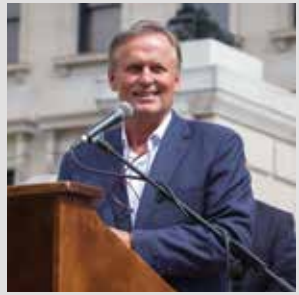
Bestselling author JOHN GRISHAM

and Jackson State University’s “Sonic Boom of the South” marching band launched the very first Mississippi Book Festival in 2015 as a loud and proud celebration of reading, writing, storytelling, and the state’s significant contributions to American literature. Exceeding expectations, more than 3,700 flocked to the grounds of the Mississippi State Capitol and surrounding spots to hobnob with favorite writers and discover new ones, making this August debut the hottest draw in more ways than one. Standing-room-only crowds crammed into historic State Capitol rooms to bask in book talk – and a beloved event was born.