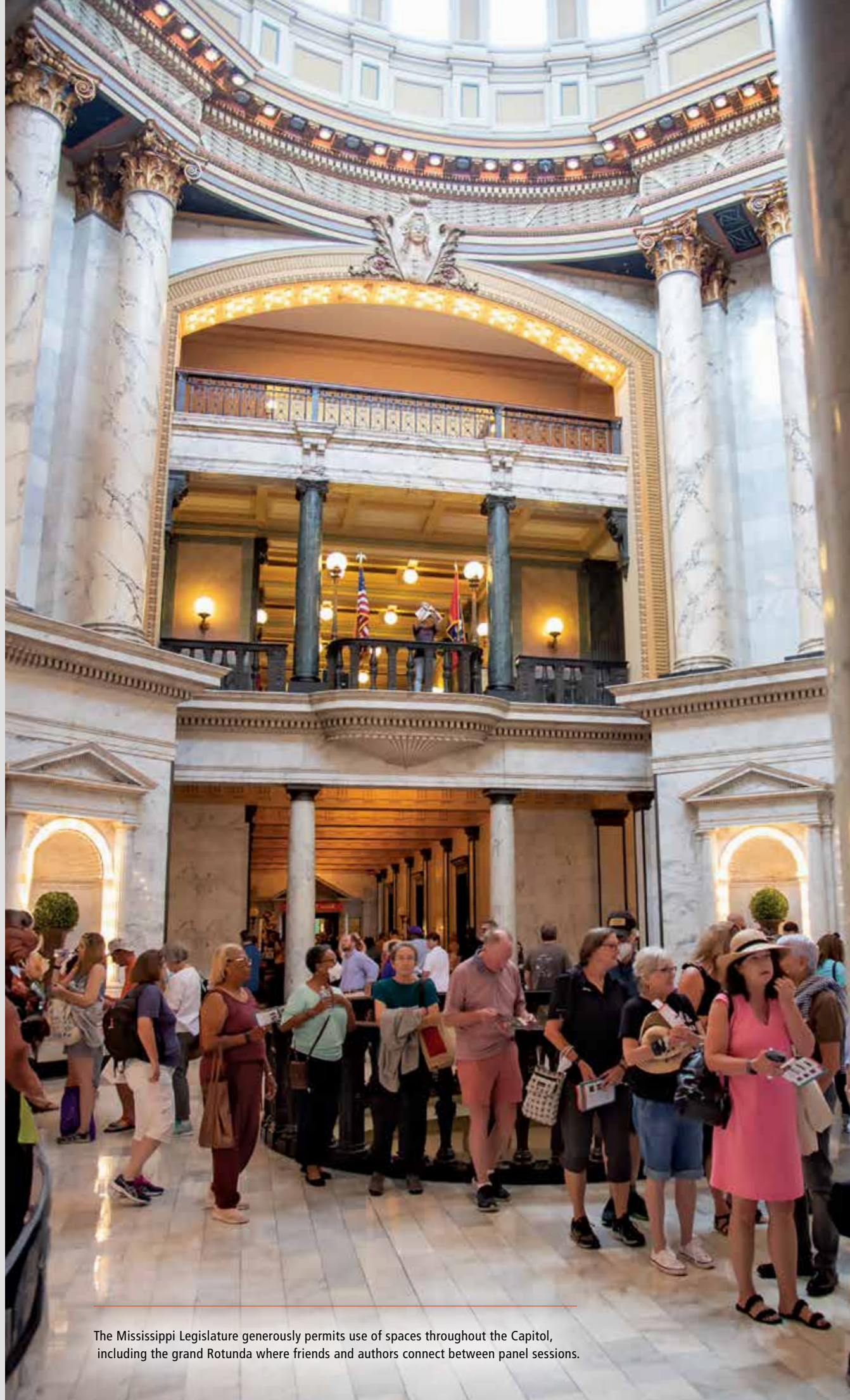
The Mississippi Legislature generously permits use of spaces throughout the Capitol, including the grand Rotunda where friends and authors connect between panel sessions.