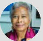
– ALICE WALKER – AUTHOR / OFFICIAL PANELIST

“... I dreamed of a day when there might be a festival such as this, when all of Mississippi would feel invited, welcomed, and comfortable.”