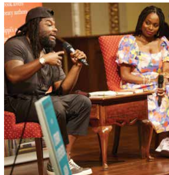
Three-time National Ambassador for Young People’s Literature Jason Reynolds touched the hearts and minds of young and old at the 2023 KidNote.

The festival is fortunate to welcome such acclaimed writers, many of whom have returned more than once to wow audiences year after year.