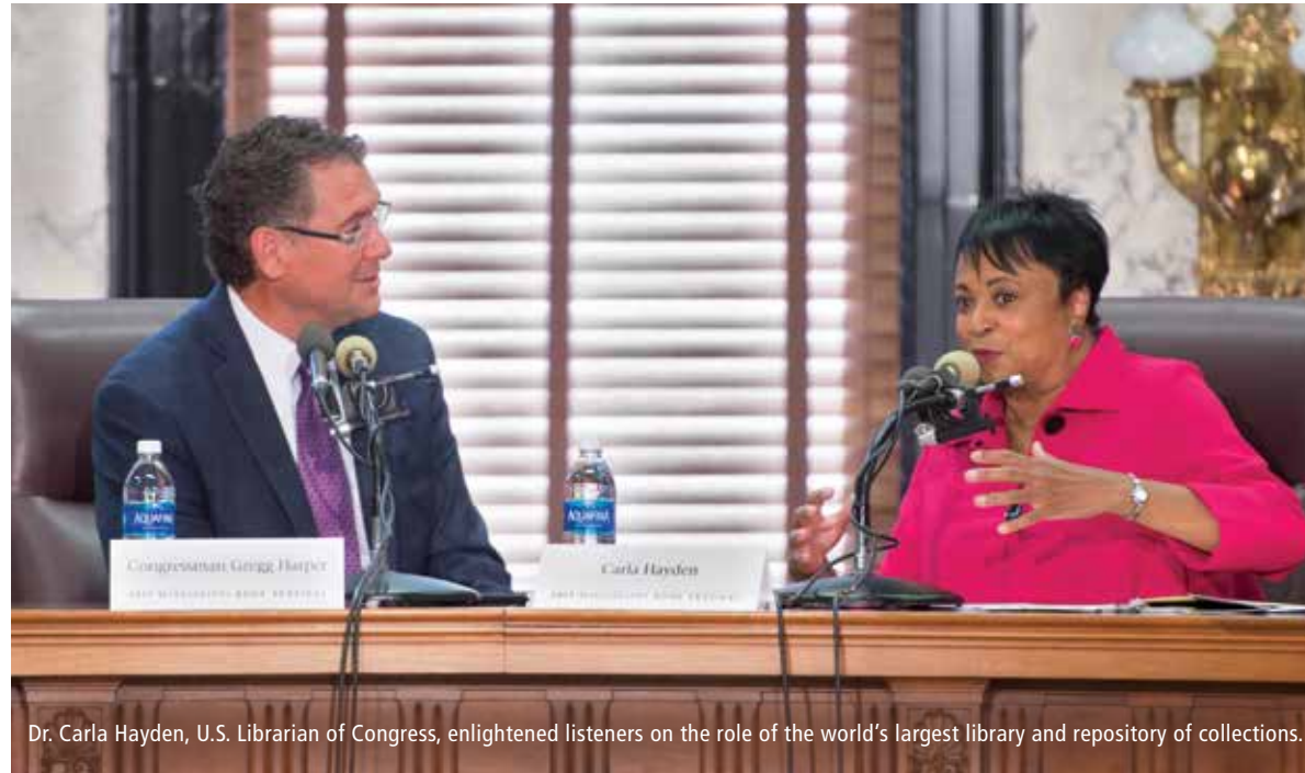
Dr. Carla Hayden, U.S. Librarian of Congress, enlightened listeners on the role of the world's largest library and repository of collections.

Each year, the Old Supreme Court Room of the State Capitol Building becomes a prestigious venue for official panel sessions and C-SPAN is there all day, providing live coverage to a national audience and later rebroadcasting on C-SPAN Book TV. MPB provides live-streaming of all sessions from often crowded Galloway Sanctuary, and pegs visiting authors for interviews featured on the festival's ongoing podcast, Write On, Mississippi!