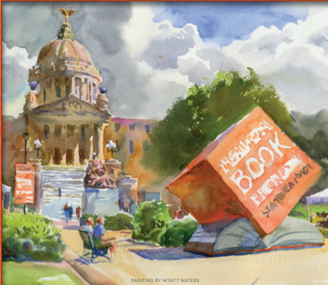
PAINTING BY WYATT WATERS