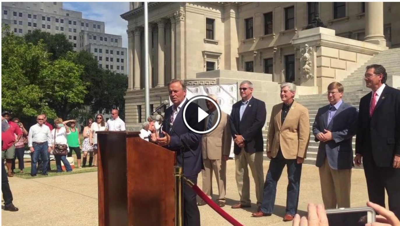
best selling author John Grisham returned to the Mississippi Capitol grounds for the first time since he served in the Legislature for the inaugural Mississippi Book Festival.